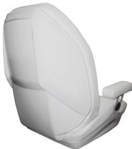
Struttura in vetroresina Fiberglass structure