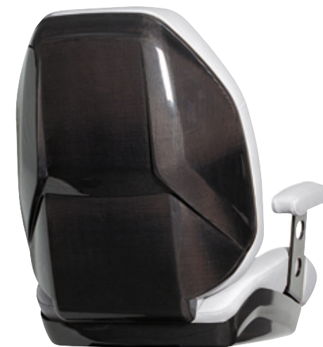
Struttura in carbonio Carbon fiber structure